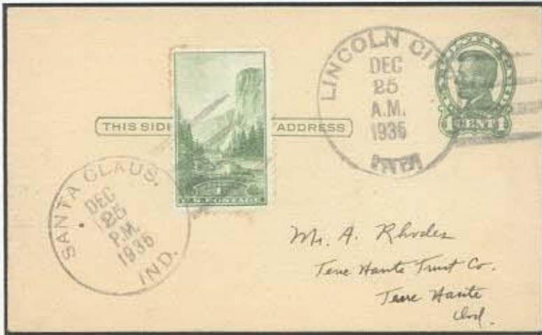
POSTAL CARD – 1935 CHRISTMAS DAY POSTMARKS LINCOLN CITY AND SANTA CLAUS, INDIANA