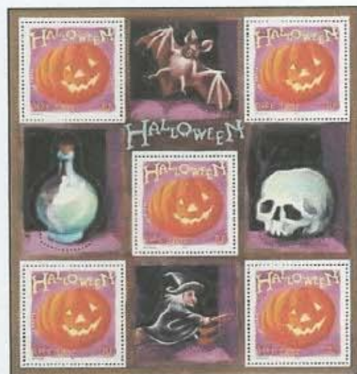
FRANCE SOUVENIR SHEET – SCOTT #2839a (ISSUED ON OCT 20, 2001)