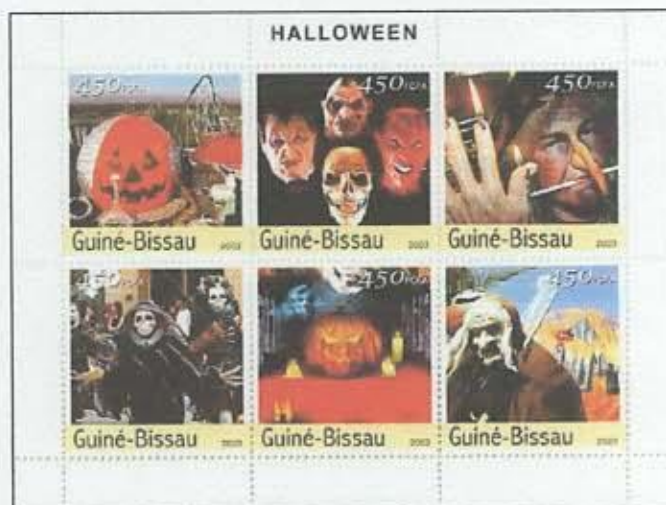
GUINEA-BISSAU 6 STAMP SHEET– GIBBONS #3809 (ISSUED IN 2003)