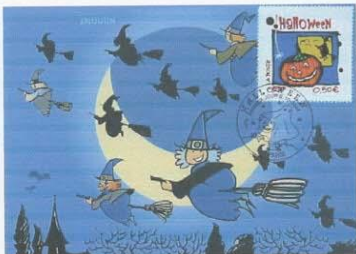
FRANCE MAXIMUM CARD – SCOTT #3048 (ISSUED ON OCT 9, 2004)