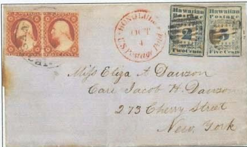
OCTOBER 4 (1851) COVER WITH HAWAII SCOTT #1 AND #2