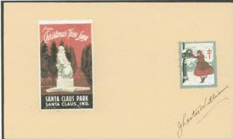
SANTA CLAUS PARK ADV. LABEL AND 1935 CHRISTMAS SEAL