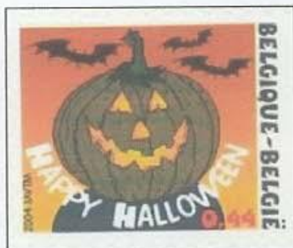
BELGIUM – SCOTT #2044