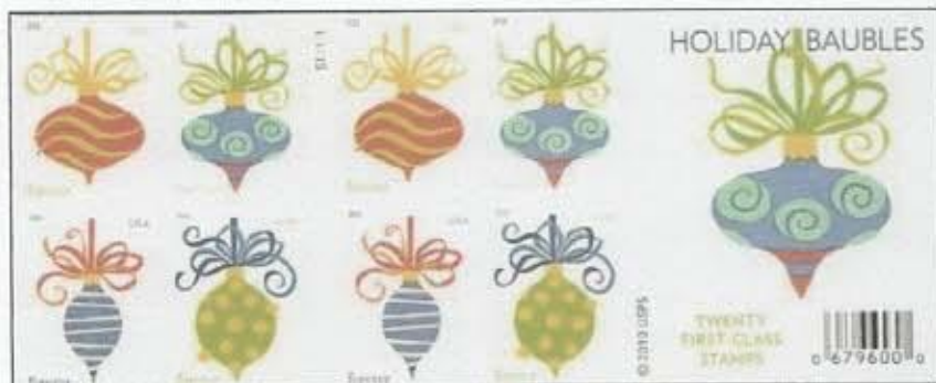
HOLIDAY BAUBLES BOOKLET