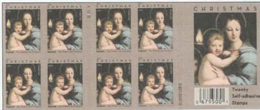
MADONNA OF THE CANDELABRA BY RAPHAEL - BOOKLET