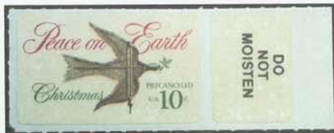
1974 USA CHRISTMAS STAMP (Scott #1552) FIRST U.S. SELF-ADHESIVE STAMP INSCRIBED "PRECANCELED"