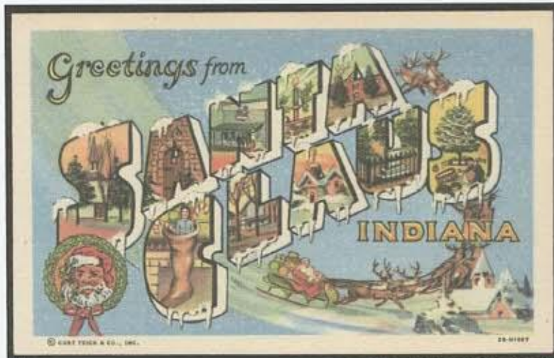
1942 GREETINGS FROM SANTA CLAUS INDIANA POSTCARD