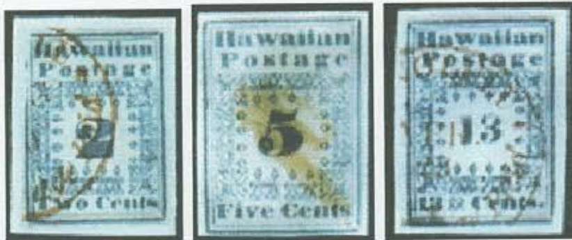
FIRST THREE HAWAIIAN STAMPS – ISSUED OCTOBER 1, 1851

One hundred sixty (160) years ago this month, on October 1, 1851 the first Hawaiian stamps, the so-called "Missionaries," were placed on sale at the Honolulu and Lahaina post offices. The stamps took on the name "Missionaries" because they were nearly always found on correspondence from American missionaries in Hawaii to their families back in California, New York, Connecticut, or Massachusetts. The new stamps were crudely made from type-set material obtained from "THE POLYNESIAN" newspaper and printed on very thin paper. There are only 16 examples of the 2-cent value that have survived, making the 2-cent "Missionary" one of the most valuable stamps in the world today.