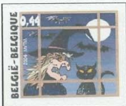
BELGIUM - SCOTT #2043 ( ISSUED ON OCT 18, 2004 IN A 10-STAMP BOOKLET)

It is, primarily observed in regions of the Western world, and among those that do the traditions and importance of the celebration vary significantly. A much celebrated holiday in Ireland and Scotland, mass transatlantic Irish and Scottish immigration in the 19th century popularized Halloween in North America. The holiday is celebrated to a lesser extent in other parts of the world.