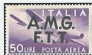
ITALY-TRIESTE "AMG" AIRMAIL (SCOTT #C6)