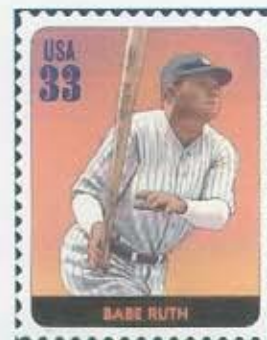
33-CENT LEGENDS OF BASEBALL BABE RUTH (SCOTT #3408h)