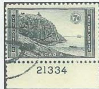
7-CENT NATIONAL PARKS PLATE SINGLE (SCOTT #746)