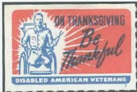
DAV THANKSGIVING SEAL (LABEL) "BE THANKFUL"