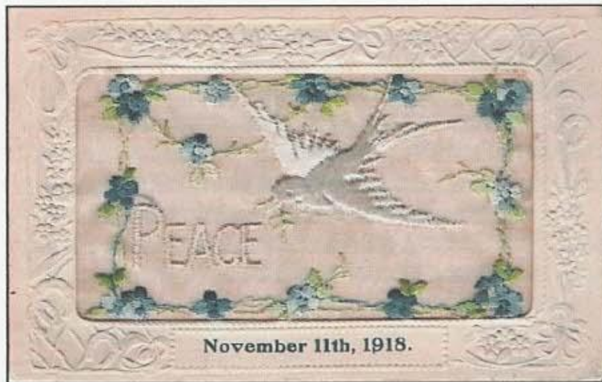
SILK POSTCARD "PEACE" NOVEMBER 11, 1918