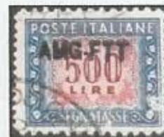
ITALY-TRIESTE "AMG" POSTAGE DUE (SCOTT #J29)