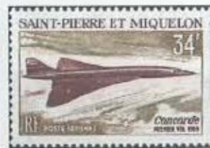
1964 ELEANOR ROOSEVELT ISSUE - SCOTT #338 (MISPERFED) AND 1969 ST. PIERRE & MIQUELON CONCORDE ISSUE – SCOTT #C40