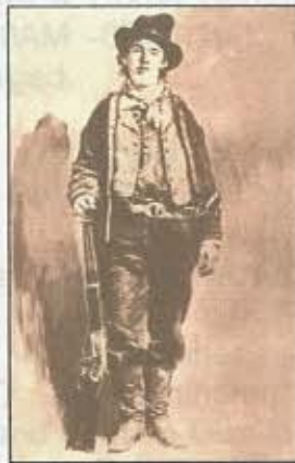
BILLY THE KID