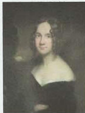
SARAH JOSEPHA HALE IN 1831