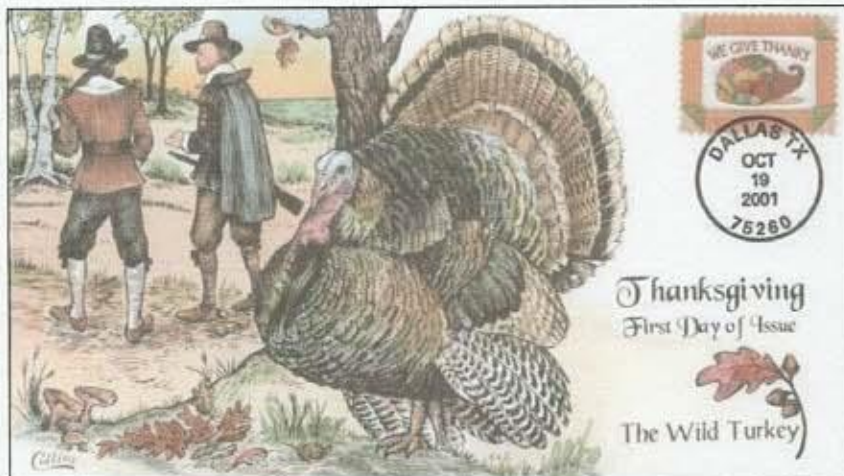
COLLINS HAND PAINTED OCT 18, 2001 FDC WITH SCOTT #3546

In 1621, the Plymouth colonists and Wampanoag Indians shared an autumn harvest feast that is acknowledged today as one of the first Thanksgiving celebrations in the colonies. For more than two centuries, days of thanksgiving were celebrated by individual colonies and states.