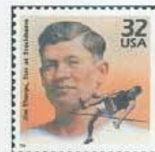
Jim Thorpe(Scott #3183g)