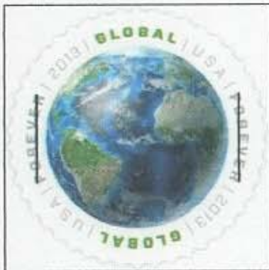
2013 GLOBAL FOREVER STAMP