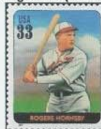
Rogers Hornsby(Scott #3408f)