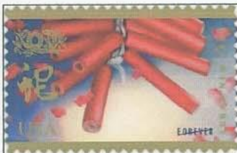
2013 YEAR OF THE SNAKE – LUNAR NEW YEAR