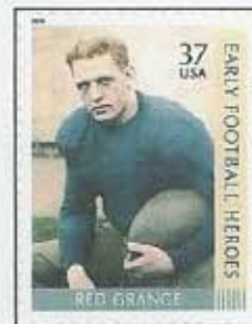
Red Grange(Scott #3811)