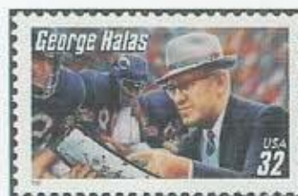
George Halas(Scott #3146)