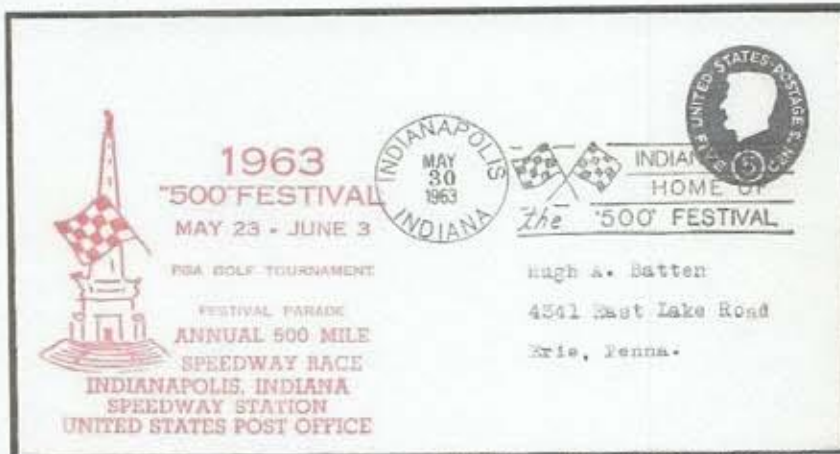
COMMEMORATIVE COVER & CANCEL – 1963 "500" FESTIVAL