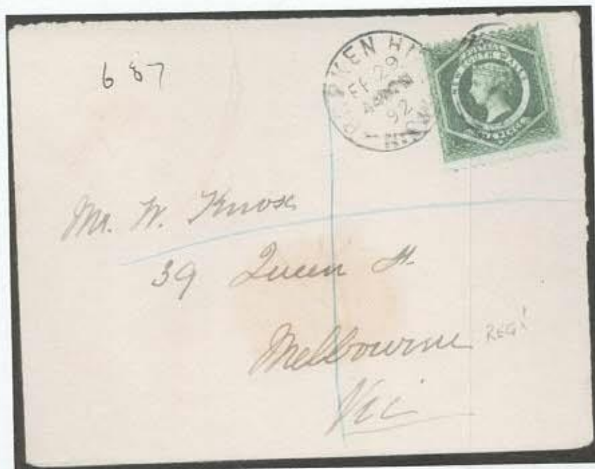
"LEAP YEAR" REGISTERED COVER FROM AUSTRALIA POSTMARKED: BROKEN HILL FE 29 92 N.S.W. (FEBRUARY 29, 1892)