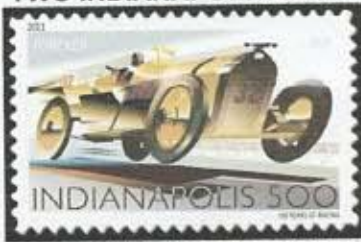
2011 UNITED STATES (#4530)