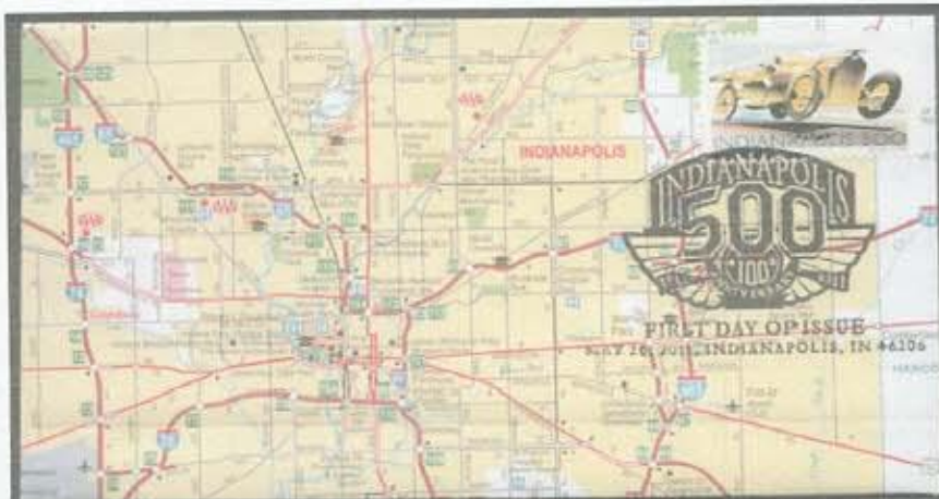
FDC – MAY 20, 2011 ON AN ALL-OVER MAP COVER OF INDIANAPOLIS