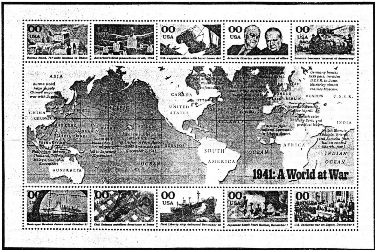
Shown here is the first of five scheduled U.S. sheetlets marking events in World War II. Two sheetlets make up a post office pane, creating a se-tenant block of 10 stamps where they meet. The essay stamps shown here bear a "00" denomination.