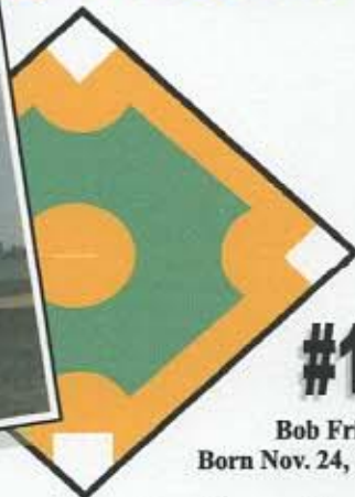
#19 Bob Friend, Born Nov. 24, 1930

Robert Bartmess Friend was born in Lafayette, Indiana. Bob was a right-handed starting pitcher for the Pittsburgh Pirates from 1951 until 1965. He was the first man to lead the National League in ERA while pitching for a last place team.