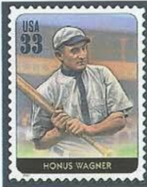
2000 UNITED STATES (SCOTT #3408q)