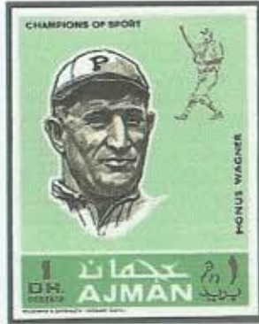
1969 AJMAN - IMPERF