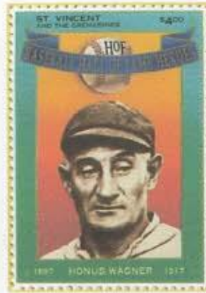
1992 ST. VINCENT AND THE GRENADINES (SCOTT #1703)