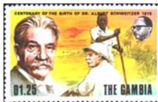
1975 THE GAMBIA (ALBERT SCHWEITZER)