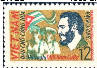
1963 NORTH VIETNAM (FIDEL CASTRO)

HISTORICAL FACTS WITH PHILATELIC CONNECTIONS OVER THE YEARS, STAMPS HAVE BEEN ISSUED FOR ALBERT SCHWEITZER, SANDY KOUFAX, GAMBIA, MALDIVES, SINGAPORE AND FIDEL CASTRO