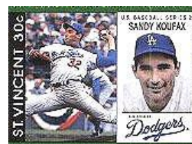
1989 ST. VINCENT (SANDY KOUFAX)