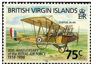
1998 BRIT. VIRGIN ISL.