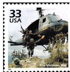
1999 USA – VIETNAM WAR