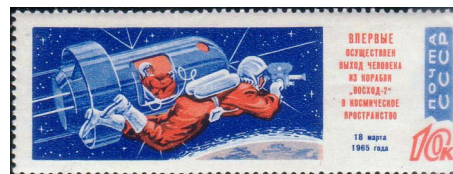
1965 RUSSIA SPACE (LEONOV)