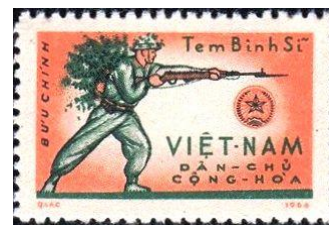
1964 NORTH VIETNAM