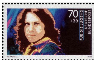
1988 GERMANY (JIM MORRISON)