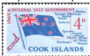
1965 COOK ISLANDS