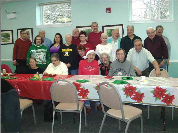
CHRISTMAS PARTY – GROUP PHOTO OF MOST WHO ATTENDED Thanks to all who brought food and desserts

Photos from the Christmas Party, held on Sunday, December 11th