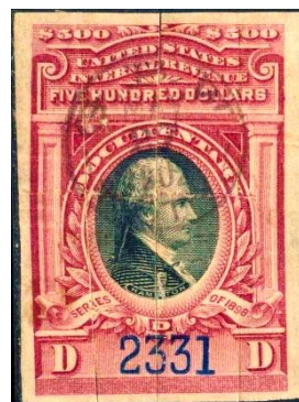
1899 REVENUE ( #R180)