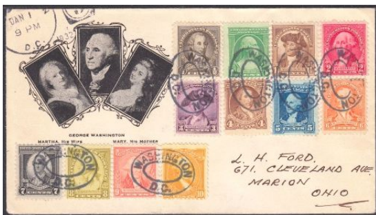
JAN 1, 1932 WASHINGTON BICENTENNIAL

If at all possible try and come to one of our meetings and of course visit WILKPEX 2017 being held on April 22nd and 23 rd .