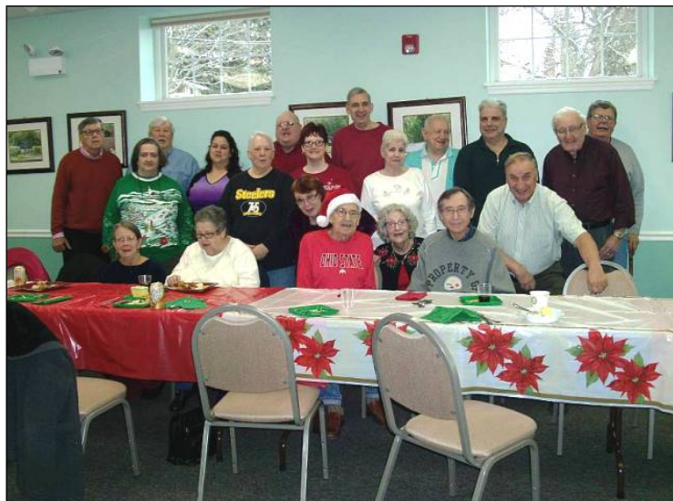
CHRISTMAS PARTY – GROUP PHOTO OF MOST WHO ATTENDED Thanks to all who brought food and desserts

Photos from the Christmas Party, held on Sunday, December 11th