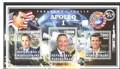
2015 MADAGASCAR S.S.

HISTORICAL FACTS WITH PHILATELIC CONNECTIONS OVER THE YEARS, STAMPS HAVE BEEN ISSUED FOR THE GREEN BAY PACKERS AND FOOTBALL AND ASTRONAUTS AND SPACE PROGRAMS