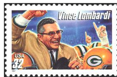
1997 U.S.A. - LOMBARDI