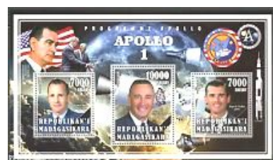
2015 MADAGASCAR S.S.

HISTORICAL FACTS WITH PHILATELIC CONNECTIONS OVER THE YEARS, STAMPS HAVE BEEN ISSUED FOR THE GREEN BAY PACKERS AND FOOTBALL AND ASTRONAUTS AND SPACE PROGRAMS