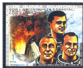
1972 EQUATORIAL GUINEA