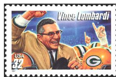
1997 U.S.A. - LOMBARDI