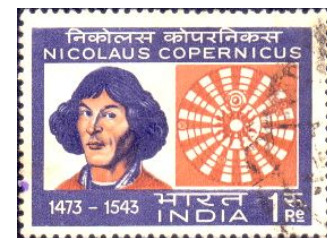
1973 INDIA – 573