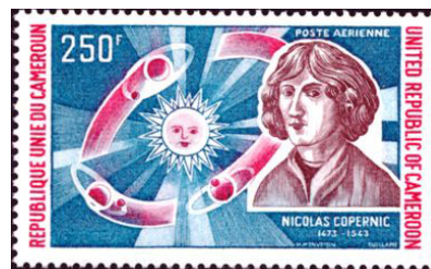
1974 CAMEROON – C220

Copernicus has been honored with stamps from many countries, especially Poland. Shown below are images of a few Copernicus stamps, a souvenir sheet and an FDC showing year, country and Scott number.