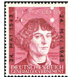
1943 POLAND OCCUPATION - NB27