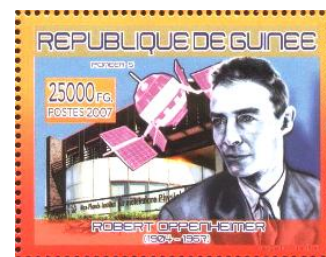
2007 REPUBLIC OF GUINEA (ROBERT OPPENHEIMER)