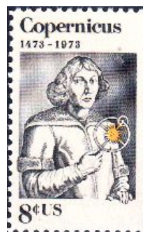
1973 U.S.A. 1488