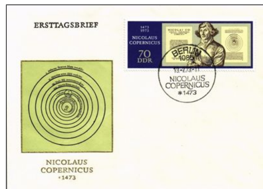
1973 GERMAN DEMOCRATIC REPUBLIC - 1461 FIRST DAY COVER