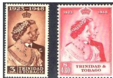
1948 TRINIDAD & TOBAGO SILVER ANNIVERSARY

HISTORICAL FACTS WITH PHILATELIC CONNECTIONS OVER THE YEARS, STAMPS HAVE BEEN ISSUED FOR MUHAMMAD ALI (AND BOXING), ROBERT OPPENHEIMER (AND THE SCIENCES) AND TRINIDAD & TOBAGO