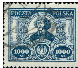
1923 POLAND – 192