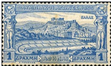
Scott #125 Stadium and Acropolis