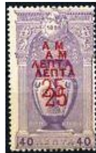
Scott #160 Vase Depicting Minerva (Double Surcharge)