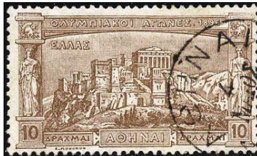
Scott #128 Acropolis and Parthenon