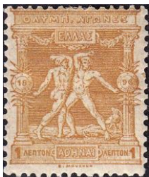
Scott #117 Boxers

As we know, there are many, many stamps, covers, postcards, etc. that commemorate the Olympics. Unfortunately, the USPS has, once again decided NOT to issue an Olympic Games stamp or stamps. I can't figure that one out. Below are a few examples of Summer Olympic Games and related stamps. Greece issued a set of 12 stamps (Scott #117-128) in 1896 to commemorate these 1 st International Olympic Games of the modern era. Six of these stamps (Scott #159-164) were surcharged with new values in 1900-01. Counterfeit surcharges exist. Below are images of some of the 1896 & 1900-01 stamps.