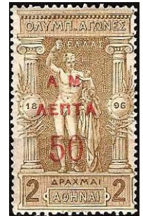
Scott #161 Statue of Hermes