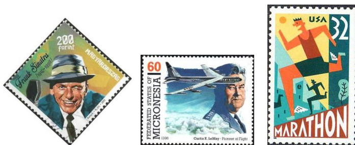
FRANK SINATRA STAMP – 2015 HUNGARY